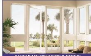
CASEMENT WINDOWS & DOORS

The HD Patio system is designed to meet the demand of more glass area with less vertical divisions. A 2-pane version can be 19' wide and 10' high. A single sash can weigh upto 300 kgs with 36 mm glazing.