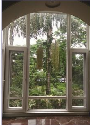
TWIN SASH WINDOWS & DOORS

Lift and slide doors are designed for larger openings with unobstructed views. A single sash can be 9' in width and 10' in height and can weigh upto 300 kgs with 36 mm glazing. It gives 50% clear opening with heavy duty tandem rollers for smooth operations.