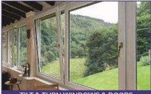
TILT & TURN WINDOWS & DOORS

This new-generation door, designed for large openings, joins multiple sashes in a unique slide and fold mechanism. The sashes move in either direction (left or right) and can be stacked at either end providing 100% opening.