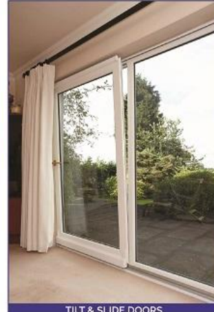
TILT & SLIDE DOORS

Arched windows can turn an attractive outer house design into something truly beautiful. An arched window is created as either a stand-alone window or incorporated into the door design as a part of the door screen, as an overhead fanlight.