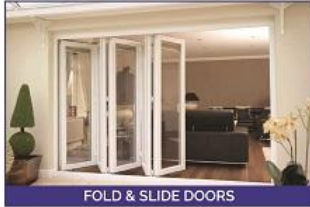
FOLD & SLIDE DOORS

This new-generation door, designed for large openings, joins multiple sashes in a unique slide and fold mechanism. The sashes move in either direction (left or right) and can be stacked at either end providing 100% opening.