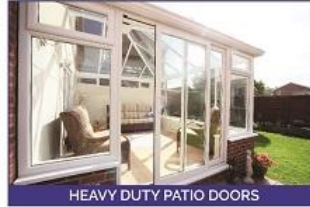
HEAVY DUTY PATIO DOORS

Twin Sash windows & doors are designed to provide ultimate flexibility to customers with the option to combine fly screen, glass, security grill and louvers all in a single system.