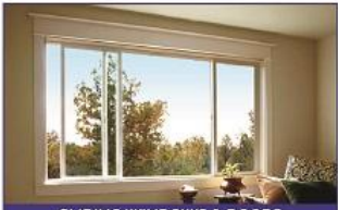
SLIDING WINDOWS & DOORS

Vertical Sliders are perfect for narrow and tall apertures and can provide upto 50% opening.