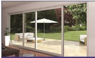
LIFT & SLIDE DOORS

The sliding Windows & Doors can be designed in one, two and three track systems with fly screen option and opening area varying from 33% to 75%. Security grill can also be integrated within the system.